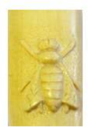
Sculpted bee (on the left part of the handle)