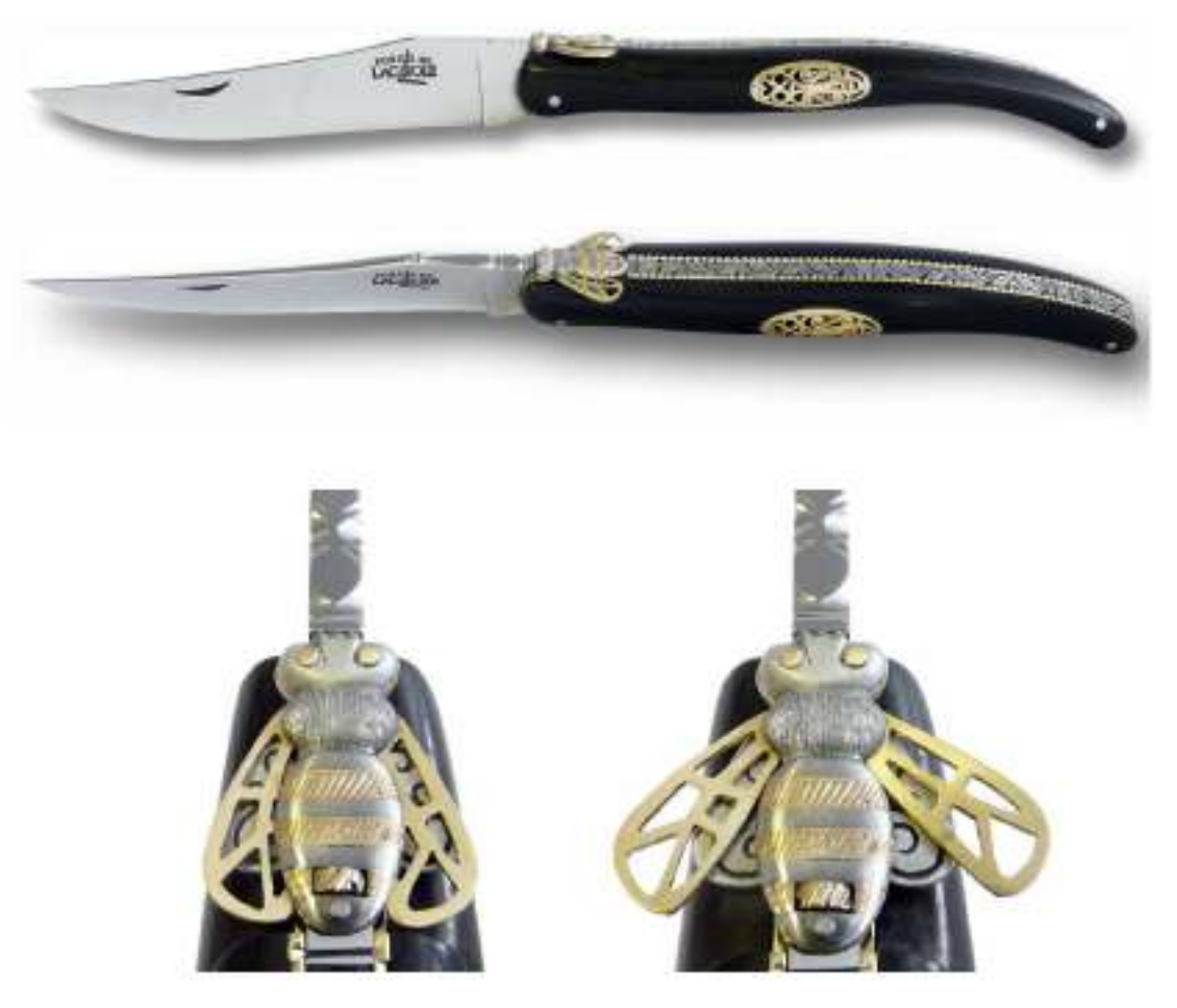
Mechanical brass wings (closed and opened positions)